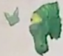
2. Horse Head