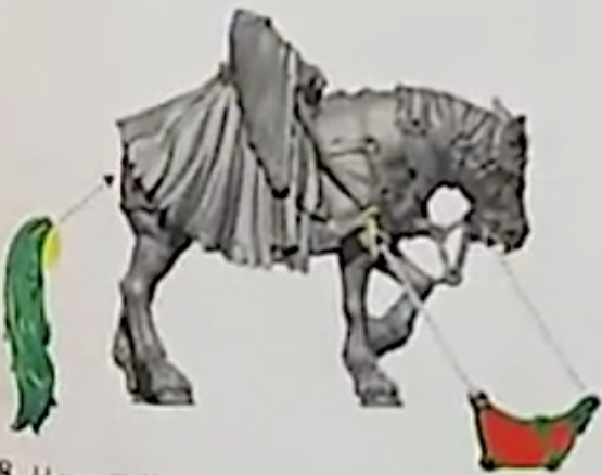
8. Horse Tail