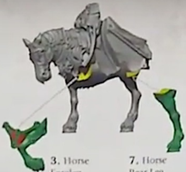
3. Horse Foreleg