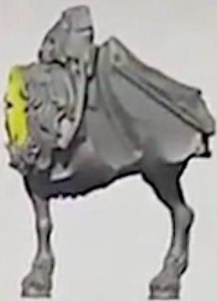
4. Horse Body