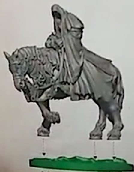
10. Diorama Base